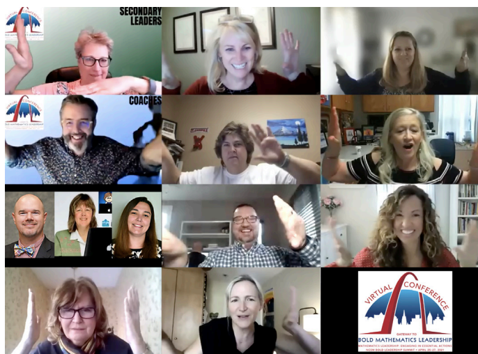
(photo title: Bold Leadership Summit Planning Committee April 2021)

After three years of planning, including postponing from September 2020 to April 2021 and then moving to a full virtual learning experience, NCSM finally hosted the Bold Leadership Summit virtually Sunday, April 25 to Tuesday, April 27, 2021. We had about 500 participants including 28 teams that ranged from 4 members to 20 members.